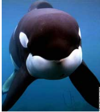
Keiko became a darling of children through his stardom in the movie 'Free Willy.'

The grave site, a lush and grassy field during the summer, was covered with snow and barely visible by daylight Monday.